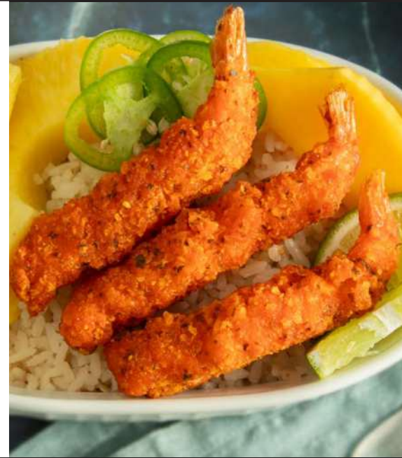
Spicy Jalapeno Shrimp