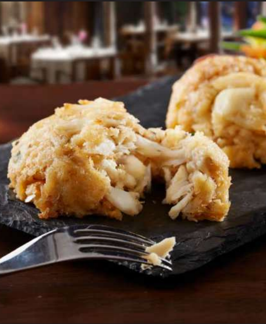
Ultimate Crab Cakes