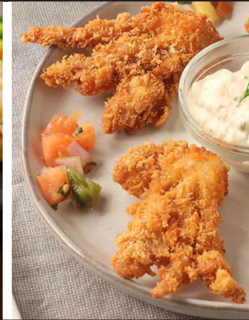
Panko Portion Soft Crabs